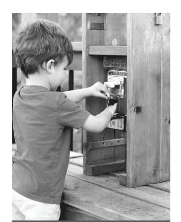
It's back! A generous handful of feed for 25¢.

A reminder that every neighbor is invited to our monthly board meetings. The first 30 minutes are available for neighbors to ask questions, relay concerns, report problems or offer solutions. Social media can be a valuable tool, but in-person interactions are always the best for everyone involved. Our upcoming monthly Board meetings are set for 7 p.m. Tuesday, May 14 and 7 p.m. Tuesday, June 11 at race UMC across Ridgeview Road from NWT.